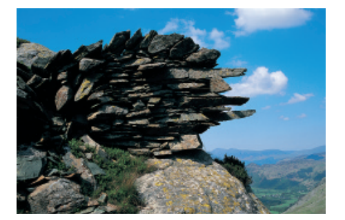
Wall above Raven Crag