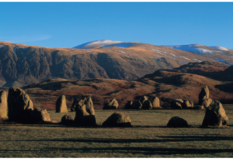
Castlerigg Stone Circle and the Dodds