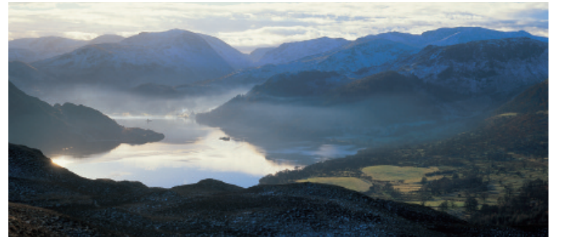
Ullswater from Gowbarrow Fell